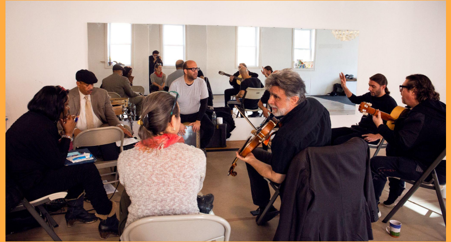
Rehearsals at Clinard Dance studio in Pilsen for the Barrio en Barrio Project, 2021. This project will premiere in November 2023 at Green Line Performing Arts Center in Washington Square (Arts and Public Life).