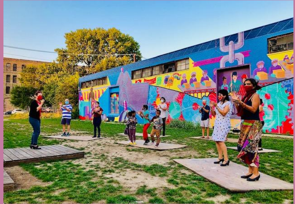
Free outdoor community class at El Paseo Garden in Pilsen 2020-present.