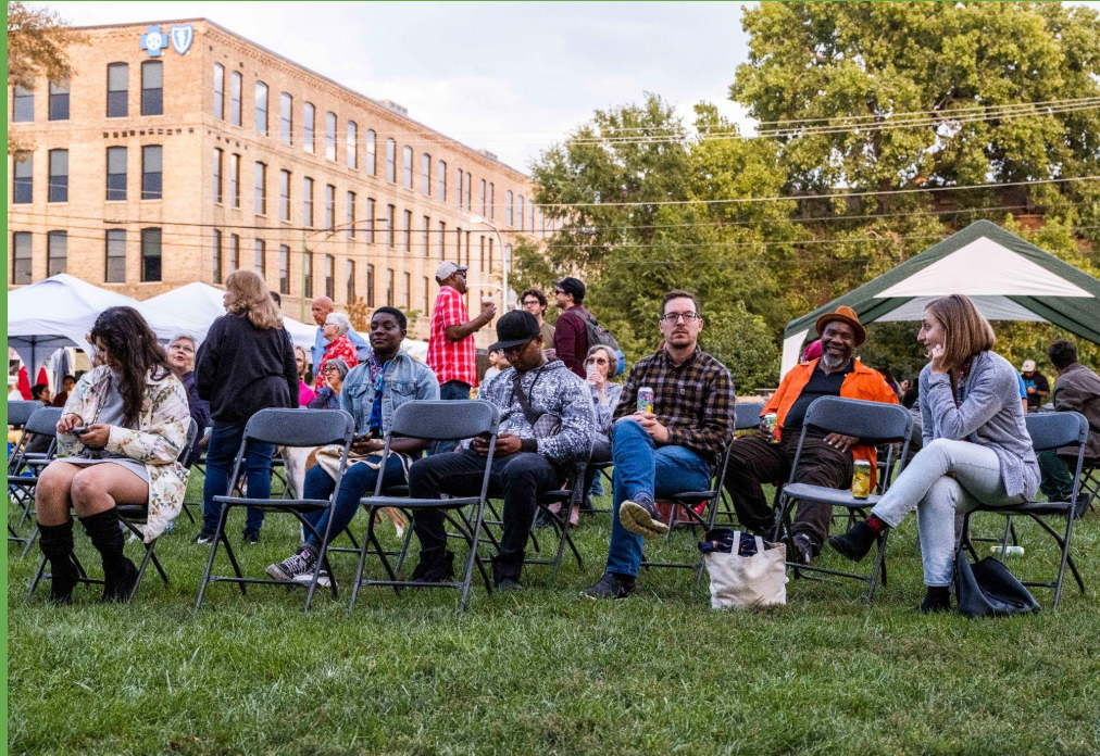
Public at El Paseo's annual Harvest Festival 2022.