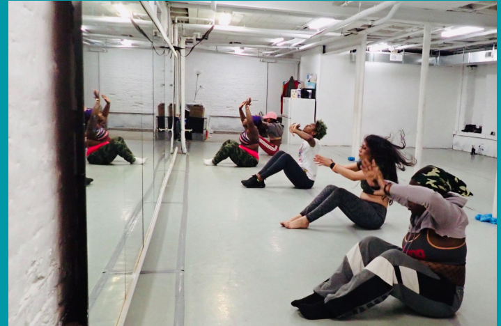
Body Confidence for Queens in residence at Clinard Dance 2020-present.