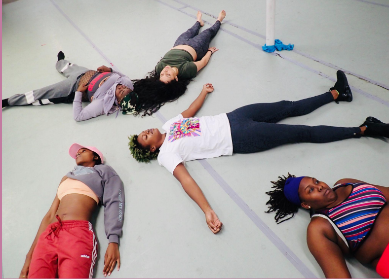
Body Confidence for Queens in residence at Clinard Dance studio in Pilsen. 2020-present.