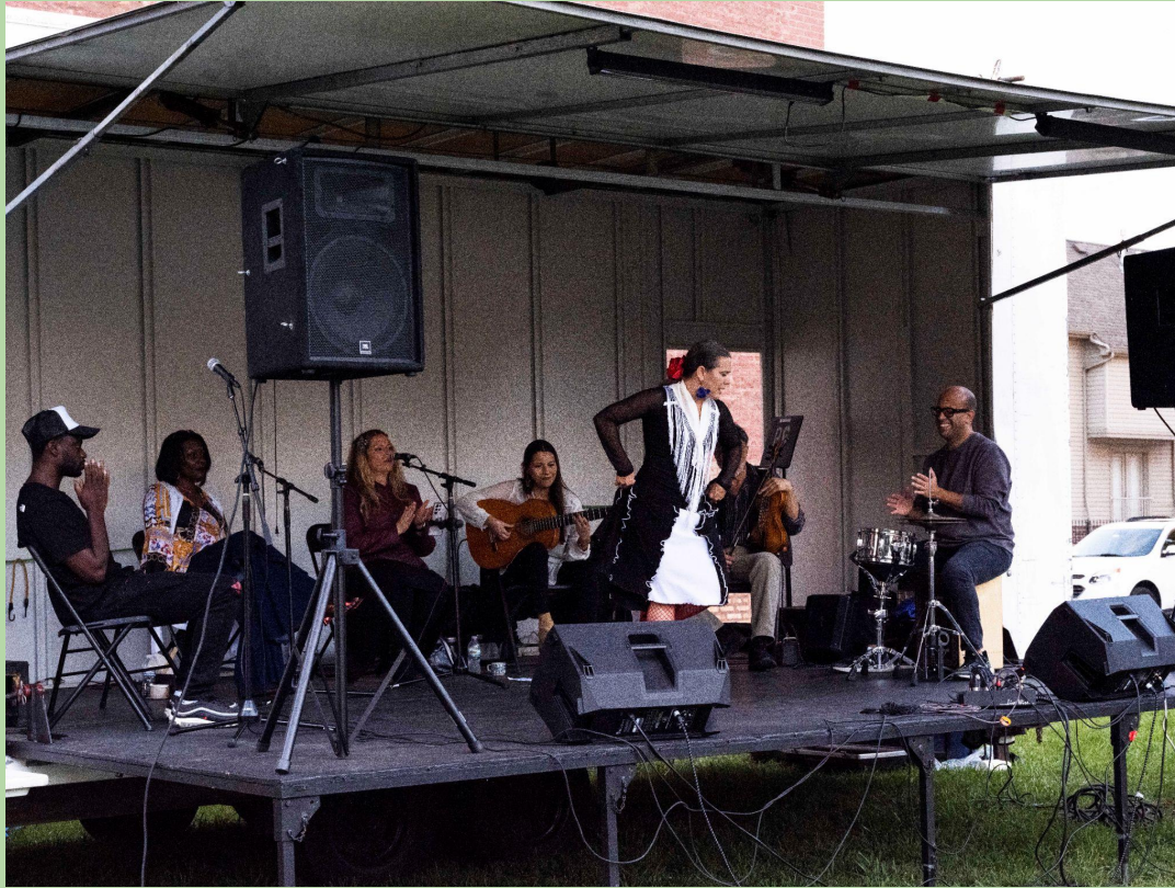
Co creations between flamenco, blues, jazz and rap at El Paseo's Harvest Festival 2022.